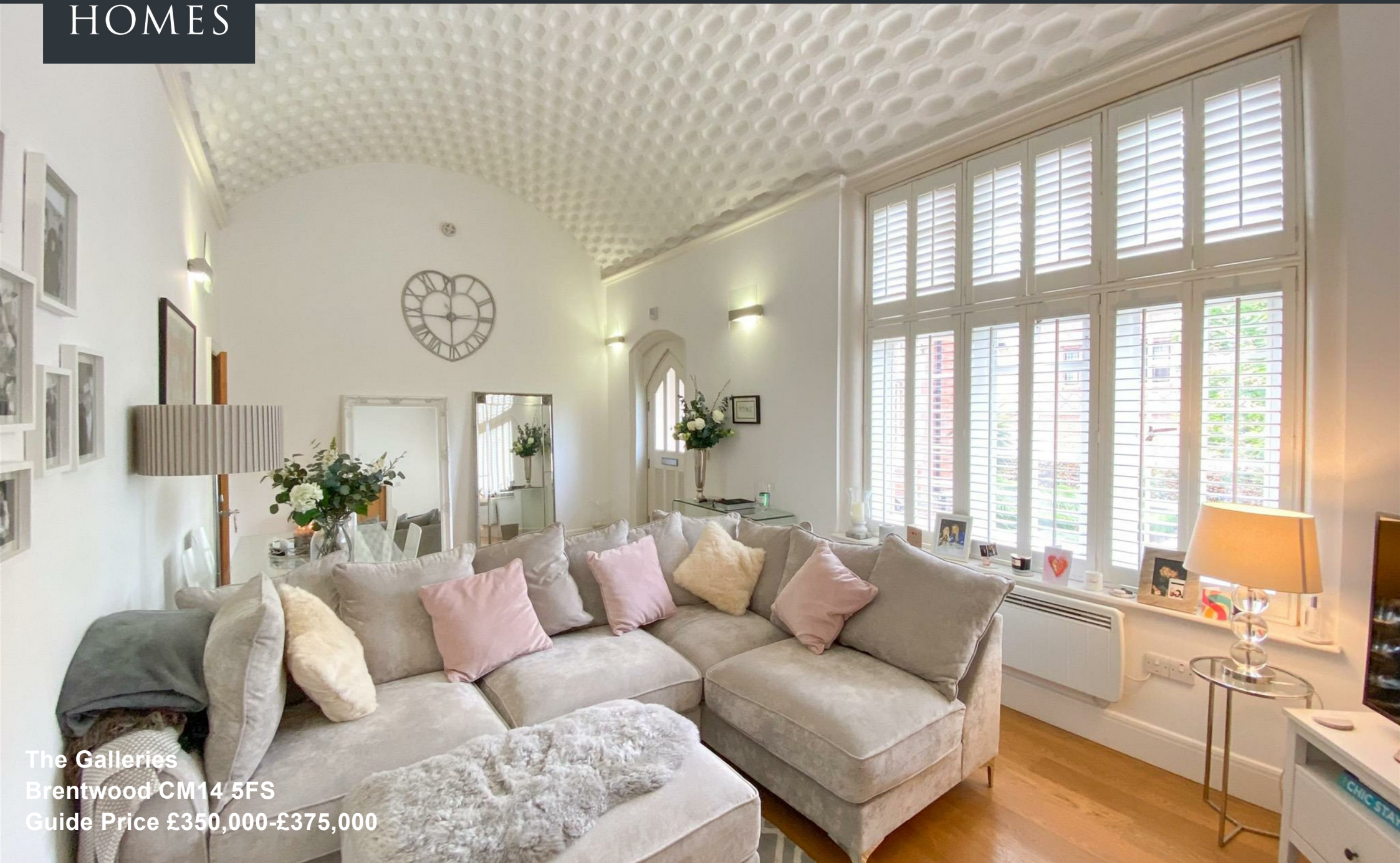
The Galleries Brentwood CM14 5FS Guide Price £350,000-£375,000